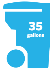
Fits about 3 tall kitchen bags

Please e-mail requests to change cart size to Groot directly ( lakebluff@groot.com ) and include your name, address, and phone number. Requests must be made before April 14th, and will be fulfilled no later than May 30th. Make sure to specify which cans to exchange (trash or recycling).