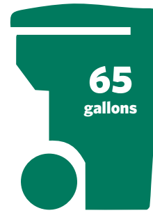
Fits about 5 tall kitchen bags