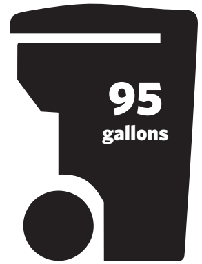
Fits about 7 tall kitchen bags