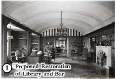
1 Proposed Restoration of Library and Bar