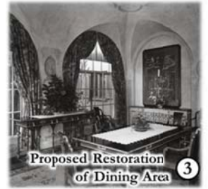
Proposed Restoration of Dining Area 3