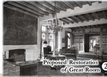
Proposed Restoration of Great Room 2