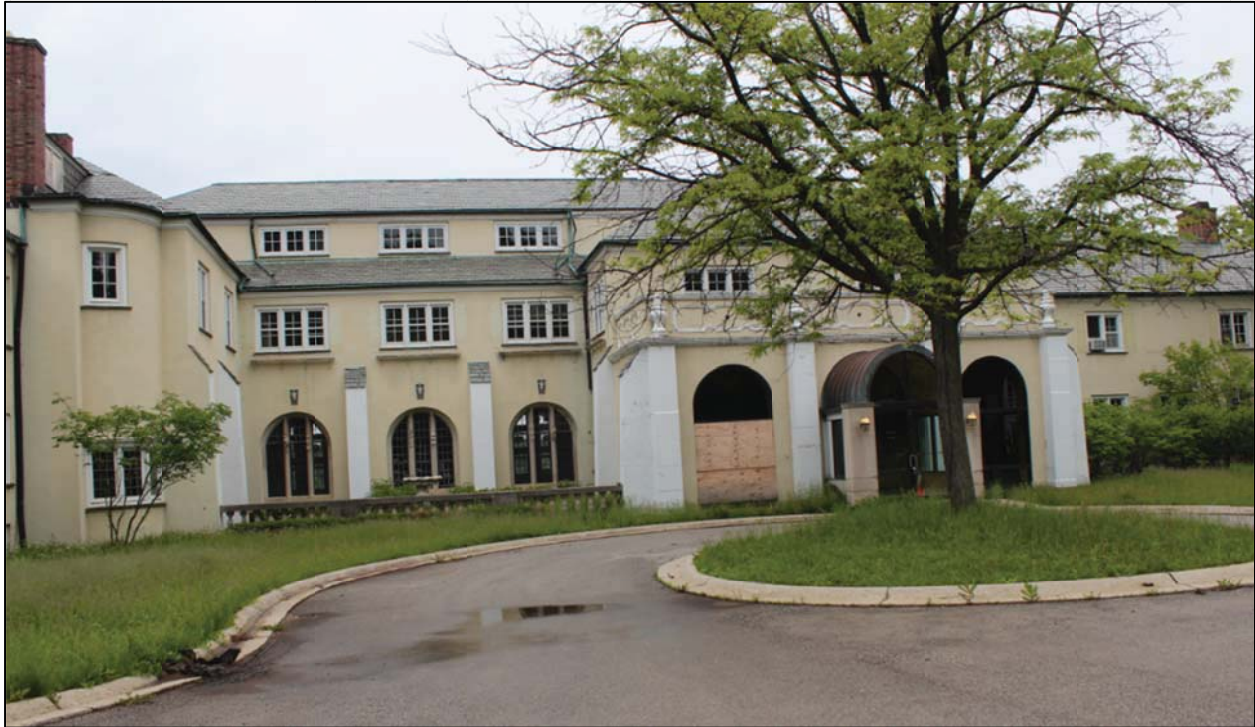
Proposed Condition: Manor House