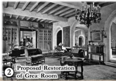
2 Proposed Restoration of Great Room